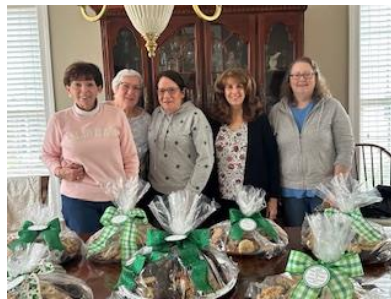
DWC members assembling trays