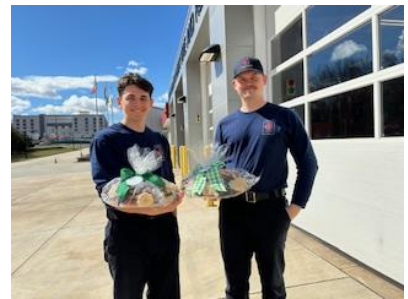
Gaineville Firefighters with their trays