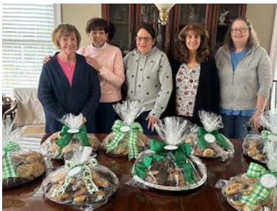
DWC Memers assembling trays